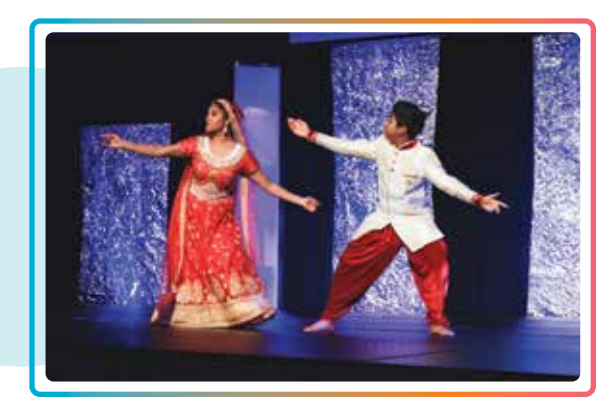
#DIWALI Cultural performances, international cuisine, and new friends. Uniting through our differences.